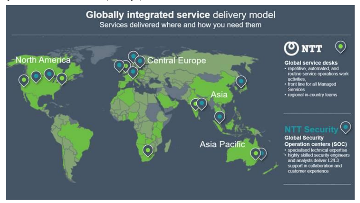
Figure 2 – Global Delivery Model

Security Analysts will assist with scan maintenance, troubleshooting, configuration, launching on-demand scans as well as stopping scans, asset maintenance and general service and or reporting questions.