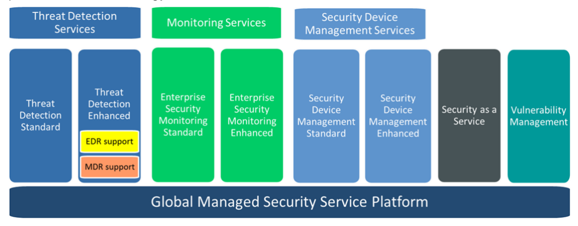
Figure 1 – Global Managed Security Service Platform

The NTT portfolio of Managed Security Services help reduce the burden of constant and proactive network monitoring, advanced security analysis, and global intelligence correlation. All our Managed Security Service offerings are powered by the NTT Security platform and combined with NTT's proven combination of people, process and technology.